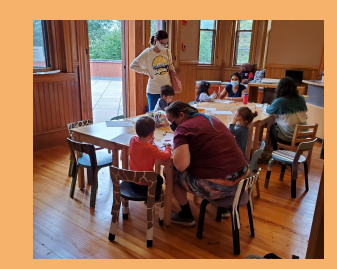
September indoor activity following outdoor storytime