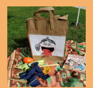
September storytime was lots of fun!

Thursday, October 21st at 10:30 AM at Thayer Memorial Library, Lancaster